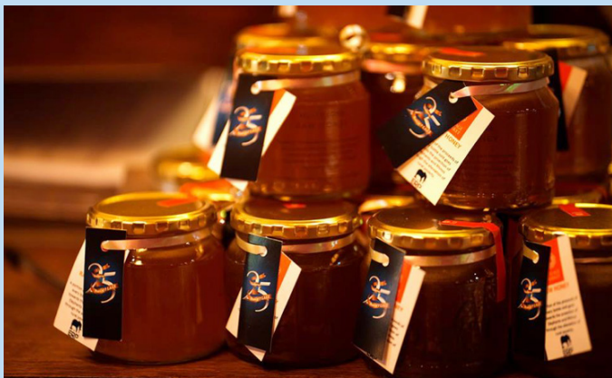
Bottles of honey, from the Beehive Fencing initiative were provided as gifts to all who attended.

A full report of this memorable occasion will be provided under separate cover.