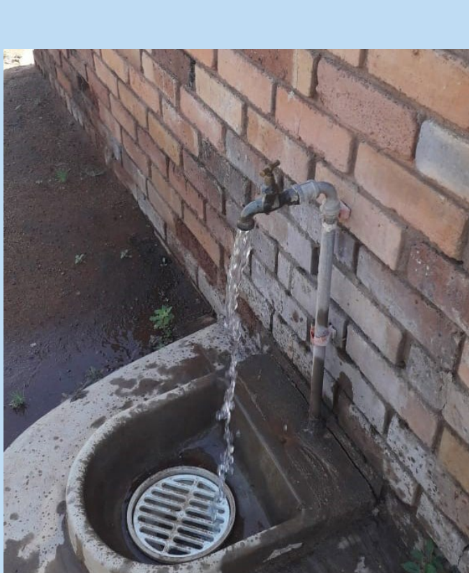
The heart warming sight of access to a supply of clean running water at the Buy Back Centre.

Through dedication and tenacity from the appointed mechanic, Samuel, we have continued to monitor and support the usage of the bikes in 5 schools in the Blouberg area. We recently received an encouraging report highlighting the impact these bikes have had in 1 of the schools, Tumakgole Secondary, where the overall pass rate at matric went from 51% in 2017 to 80% last year. All students who received bikes under our programme performed exceptionally well in their final examinations. An inspiring outcome for our Bikes4ERP programme, driven so successfully by two EPI-USE staff members, Nicolai van der Merwe and Gert Vermeulen, who are, once again, 'Going Beyond Corporate Purpose'.