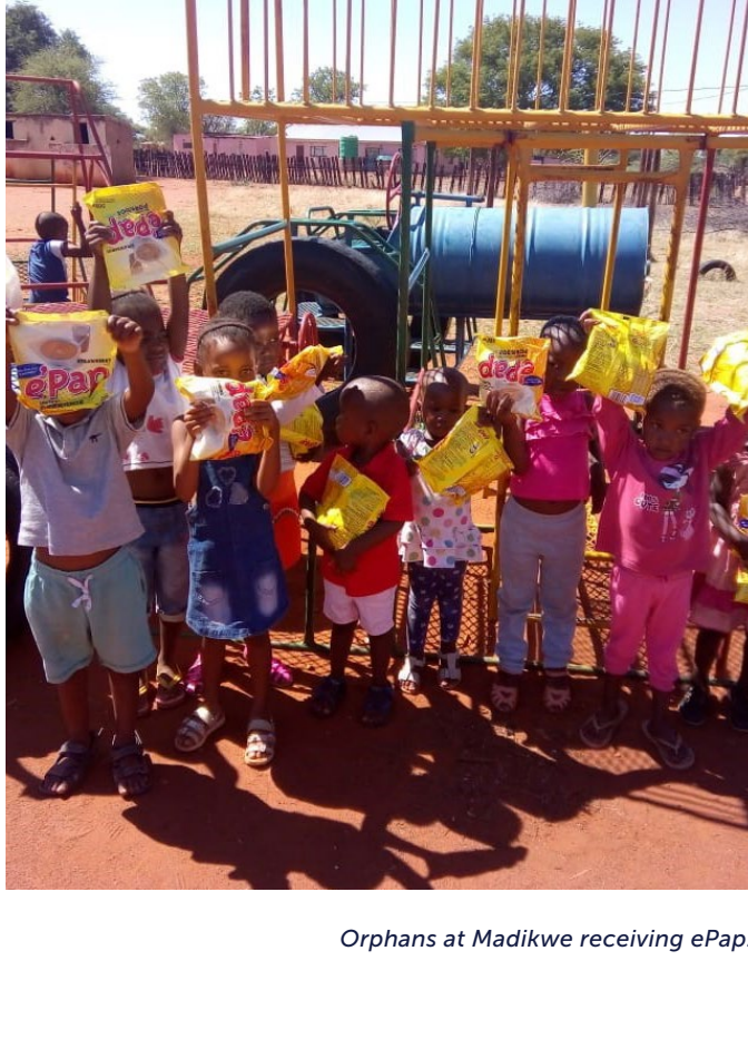
Orphans at Madikwe receiving ePap.

Through our partnership with University of Johannesburg's Process, Engineering and Environmental Technology Station (PEETS), and EPI-USE Scorecard Funding, we have been able to co-fund the drilling and installation of a borehole at the Centre to serve the Centre and the wider community. A group of 18 youth from the community will be trained to install and connect the borehole, and solar pump, and, going forward, they will be able to provide a service to the wider community in terms of the maintenance of solar facilities. The community of Kekana Gardens has, up until now, never had direct access to fresh running water. This is life-changing, and an improvement for the quality of life of the people as well as their economic future.