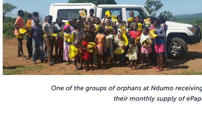
One of the groups of orphans at Ndumo receiving their monthly supply of ePap.

We are grateful to EPI-USE for the continued funding for the Ndumo orphans. In November, they availed funding for an another 5 months to ensure a constant supply of ePap to the 450 orphans that are monitored and assisted by the local Ndumo Orphans Committee.