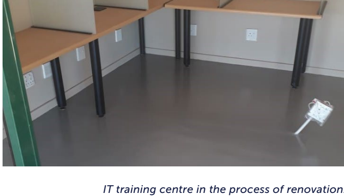
IT training centre in the process of renovation.

THIS MONTH, WE REMEMBER MARTIN LUTHER KING'S 50 TH ANNIVERSARY AND SHARE WITH YOU SOME OF HIS BEST KNOWN QUOTES THAT CONTINUE TO GUIDE US IN THE HOPE OF A BETTER WORLD.