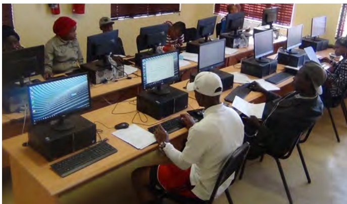
Recently two additional IT centres were established in Limpopo, funded through iLab.