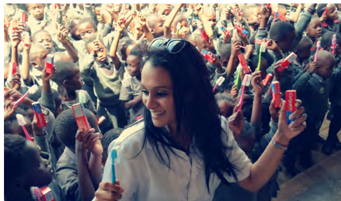
Dental hygiene – Colgate distributing toothbrushes and toothpaste to the Primary School in Kekana Gardens.