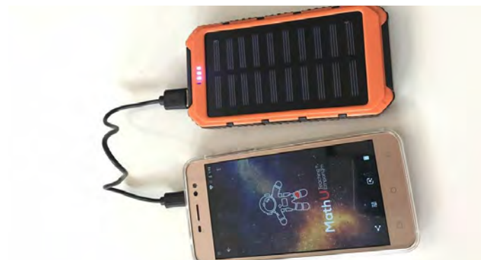
Solar powered Android.