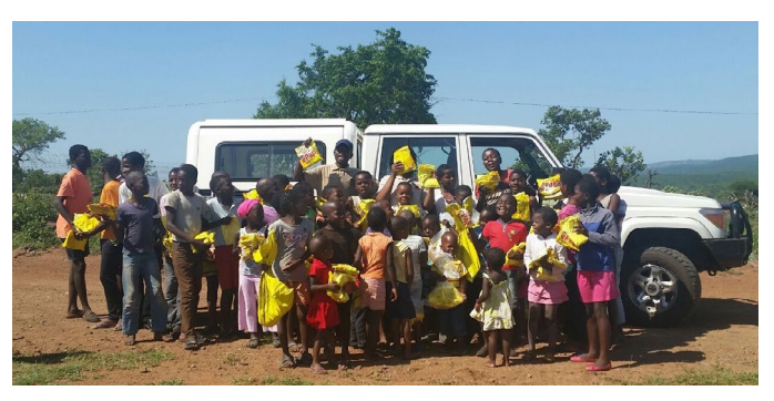
One of the groups of orphans at Ndumo receiving their monthly supply of ePap.

We are grateful to EPI-USE for the continued funding for the Ndumo orphans. In November, they availed funding for an another 5 months to ensure a constant supply of ePap to the 450 orphans that are monitored and assisted by the local Ndumo Orphans Committee.