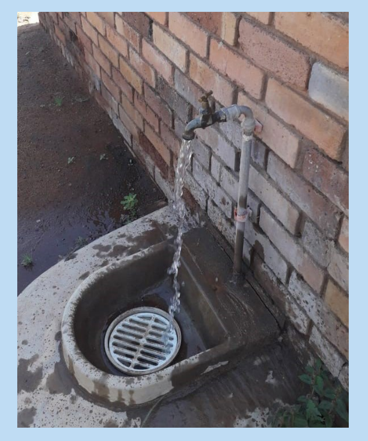
The heart warming sight of access to a supply of clean running water at the Buy Back Centre.

Through dedication and tenacity from the appointed mechanic, Samuel, we have continued to monitor and support the usage of the bikes in 5 schools in the Blouberg area. We recently received an encouraging report highlighting the impact these bikes have had in 1 of the schools, Tumakgole Secondary, where the overall pass rate at matric went from 51% in 2017 to 80% last year. All students who received bikes under our programme performed exceptionally well in their final examinations. An inspiring outcome for our Bikes4ERP programme, driven so successfully by two EPI-USE staff memebers, Nicolai van der Merwe and Gert Vermeulen, who are, once again, 'Going Beyond Corporate Purpose'.