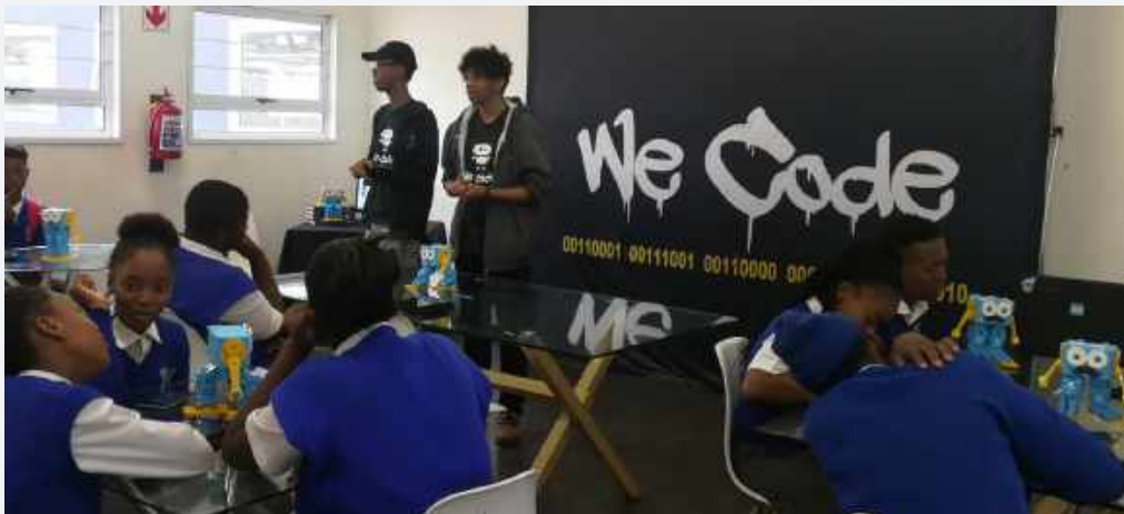
ADDITIONAL CODING FUNDING FROM ACCENTURE

Thanks again to EPI-USE America for their continued funding, we are once again able to feed the 400 Ndumo orphans with e'Pap for the next 3 months. The funding also supports the care givers who look after these orphans, often under very difficult circumstances.