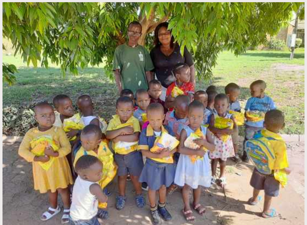
Some of the orphans at Ndumo