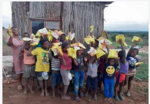
Typical dwelling place for orphans and vulnerable children at Ndumo

This time we added in an additional 40 orphans, to the list of beneficiaries, living 30km from Ndumo. These 40 children have been supported, to date, in spite of many challenges, through the dedication and fundraising efforts of a local Councillor, Johnson Gwala. The caregivers took charge of the distribution of food, under challenging circumstances, considering the widespread location of these children, throughout the area.