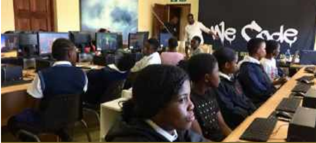
MANDELA DAY CODING AT VAALWATER

Thanks to our partners at Got-Game and Nokia (programme funders), we managed to host an hour of coding at the ERP Vaalwater (Waterberg Welfare Society – WWS) Centre as part of Nelson Mandela Day. 24 Learners from 3 local schools benefited from this programme on the day, where they were taught the basics of coding, and were introduced to the different ways in which coding can be applied to solve present-day problems. Our coding team also got an opportunity to talk about coding and ERP when interviewed at Waterberg Waves Radio Station, thereby reaching out to a wider Waterberg audience.