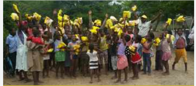
NDUMO E'PAP DELIVERY

The Centre hosted a group of learners from Metsitshehla Secondary School for their school holidays, where they were trained on basic Microsoft PowerPoint Presentations. One of the exercises that the students were given involved coming up with a PowerPoint presentation of what they were going to study immediately after they have passed their matric. They then got an opportunity to showcase these presentations on the 27th of September 2019.