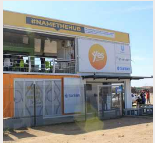
An example of a HUB deployed through Got-Game