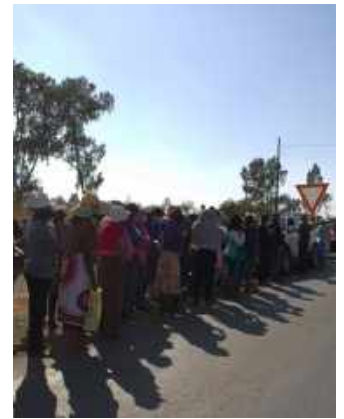
Expectant recipients stand in line outside of Madibatlou Primary School where the parcels were distributed at L&J informal settlement