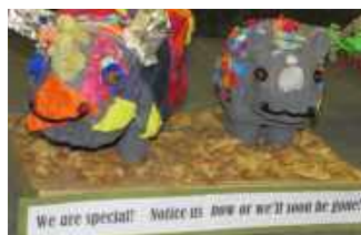
Photo on the left: Winner of the public speaking event Photo on Right: One of the artifacts made from recycled paper