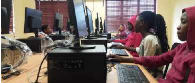
VAALWATER ICT CENTRE

The Centre hosted a group of learners from Metsitshehla Secondary School for their school holidays, where they were trained on basic Microsoft PowerPoint Presentations. One of the exercises that the students were given involved coming up with a PowerPoint presentation of what they were going to study immediately after they have passed their matric. They then got an opportunity to showcase these presentations on the 27th of September 2019.