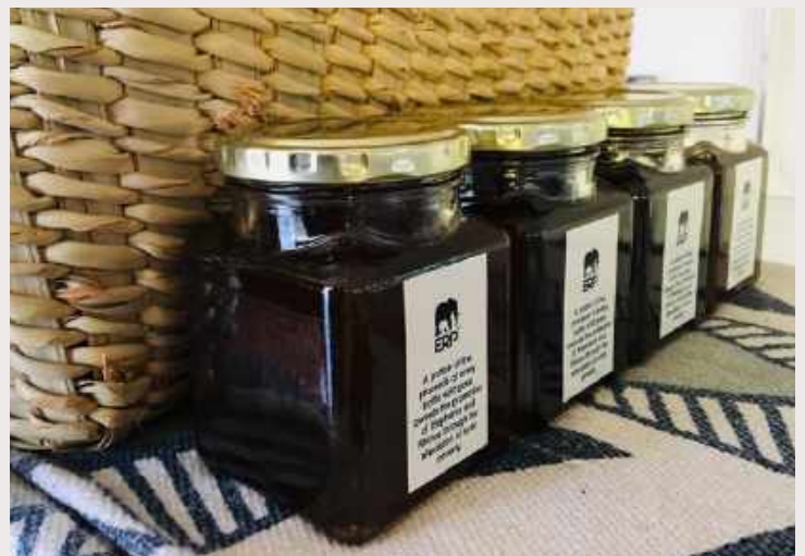
Some of the ERP branded raw honey from our beehive projects

Beehive fencing is the quintessential example of the web and interdependence established through ERP between the wellbeing of animals in the wild, and the economic opportunities associated with this, which improve the lives of local people. As a solution to the incursion of elephants into community property, this initiative simultaneously provides local bordering communities with protection against invasion by elephants, and an assured income for the beneficiaries from the production of honey. The honey production is supported by agricultural initiatives which add to the livelihood of the community while providing additional forage for the bees, thereby increasing honey production.