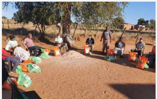
Distribution at Moepel farms villages