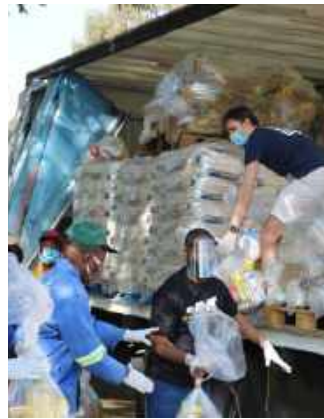
ERP volunteers offloading the food truck at L&J informal settlement, adjacent to Rietvlei Nature Reserve, where ERP is protecting wildlife using drone technology

In response to the socio-economic devastation experienced by disadvantaged communities caused by the coronavirus related Lockdown, ERP is mobilizing a campaign to feed the hungry in communities living adjacent and within our land conservation projects. In May, ERP delivered 250,000 meals to 9 communities in Gauteng, Limpopo, KwaZulu Natal and the North West provinces. These beneficiary communities are all current or future conservation partners where ERP is leasing land or is about to lease land for conservation, ensuring that local communities, benefit directly from the conservation and protection of rhinos and elephants, with support from ERP. The feeding scheme is being coordinated to cover a period of three months, in which it is envisaged that beyond that point, we will be able to implement or expand on more sustainable interventions to promote food security in these communities – with a particular focus on agriculture and the production of honey through the establishment of Beehive fencing. This programme is in keeping with the EPI-USE business model which i.e. goes 'Beyond Corporate Purpose' and provides 1% of its global revenue to support ERP initiatives, of which this feeding scheme is one such initiative. ERP uses the P.E.A.C.E. Model, through the P.E.A.C.E. Foundation Trust to address rural poverty.